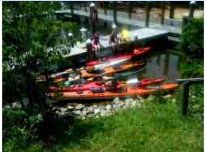
Landing at Pleasure Cove Marina

We eventually pay the bill (3 iterations before getting a correct-enough bill) and get back in our boats for the return leg. Heading back to the Bay, we stick to the north shore of the main channel. There's lots more big boat traffic as the post-holiday beauty parade back to dock begins. Sticking close to shore does not get us out of big boat traffic—there is a big sailboat under power cruising right off the end of the docks. We cut across Back Creek to the north side of the mouth of the Bodkin. Not as much big boat traffic going in and out of Back Creek The wind's breezy back on the Bay that the water's kicked up enough with wakes and wind and reflected waves to be interesting but not hard. We're paddling with the wind and against the tide and it's a good combination.