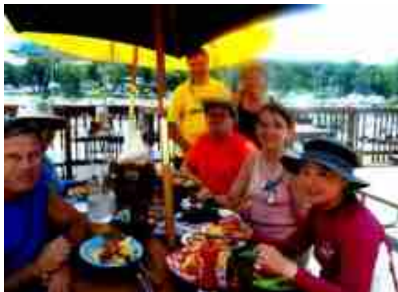
Lunch at the Cheshire Crab

Hailing Jeff on the radio on the return leg, we can't reach him. His radio isn't working. The detachable, floating radio battery detached, probably when we were getting back in the boats at the Cheshire Crab. Radio Check Moment Four: Is all of your radio still with you?