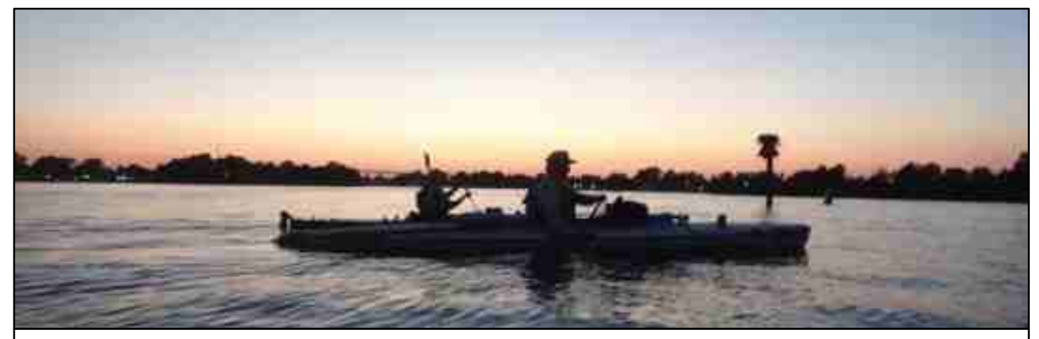
Leaving Solomon's Island at Sunset

The sun setting behind the Thomas Johnson Bridge is a familiar end-of-paddle sight for paddlers of the lower Patuxent River, but on this day it marked the start of our second annual Dusk to Dawn Paddle.