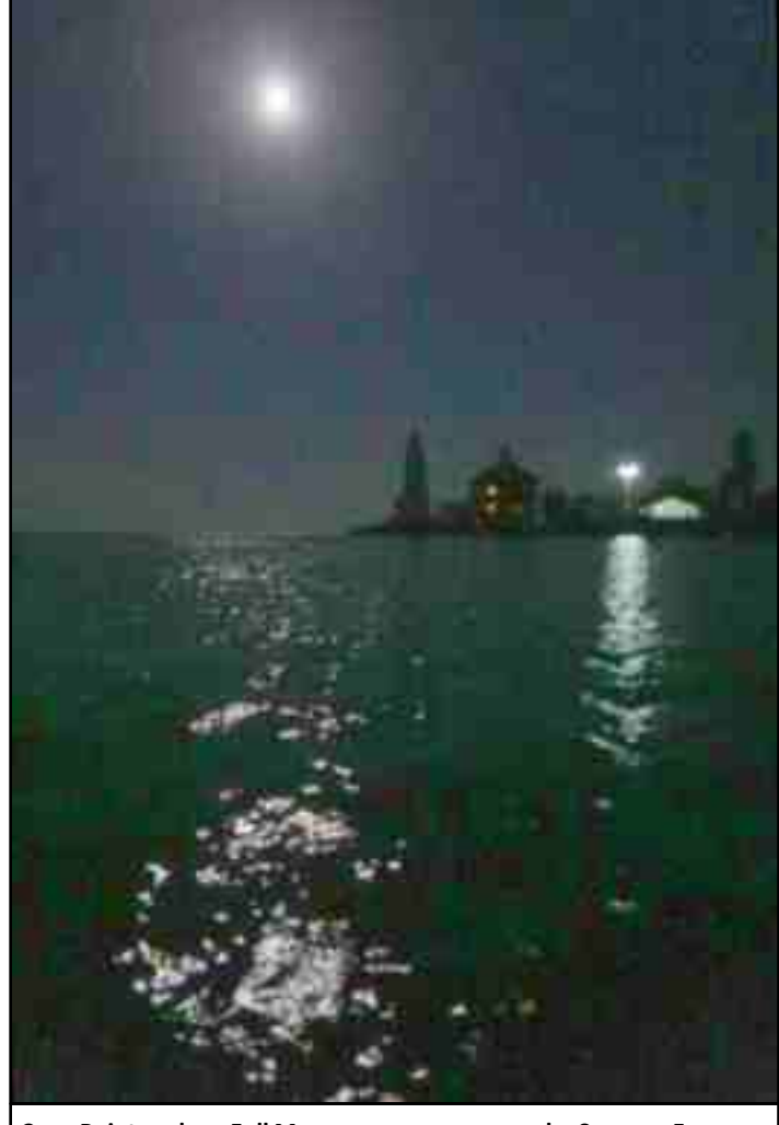
Cove Point under a Full Moon

During a shore break on Drum Point, the decision was made to visit the Drum Point Lighthouse at the Chesapeake Maritime Museum and while in the neighborhood seek out the "Schooner Hostel". I suppose you could call it a plan. Solomon's Harbor was silent as we, perhaps inconsiderately, paddled among the moored boats on the way to the museum. Incongruously the most notable feature of the museum after dark was a brightly lit Pepsi vending machine. After a short diversion up Mill Creek to attain photographic evidence of our night recon of Suzanne's friend's boat, Greg hurried us back out toopen