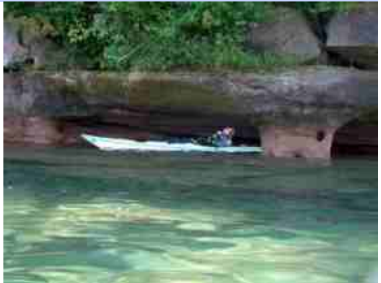
We played in the first 'sorta' sea caves we saw off of Point Detour on the mainland

In the end we only visited a few of the islands due the Superior's fickle nature. However we experienced some of the best the area had to offer – the sea caves of Devil's Island and Squaw Bay, the bald eagles and hiking trails of Oak Island, the crystal clear water, and the temperamental weather. All of this was topped off by wonderful paddling companions and some great food! I can't wait to go back to explore some more.