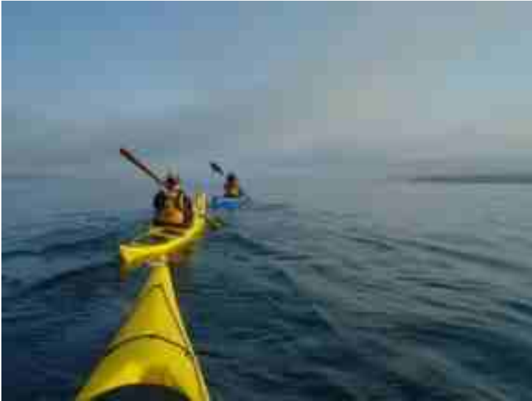
As we paddled the 7.5 miles due North the fog would move in and out