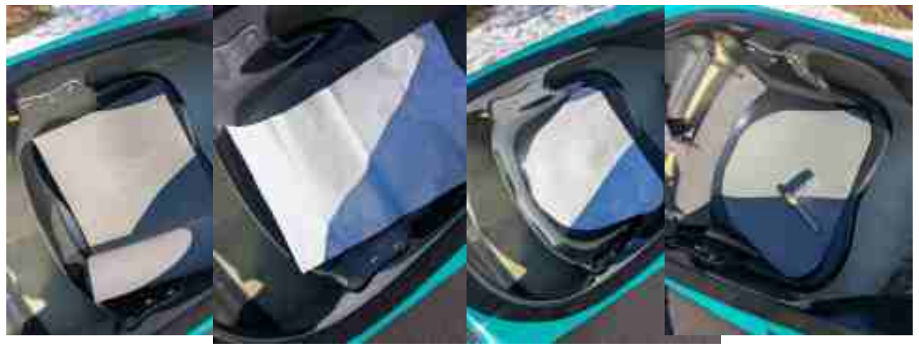
Cutting and installing foam pad: Roll of 1/4" closed cell foam, heavy paper for pattern, pattern traced and cut, pad cut but not glued. Note foam for seat bottom back cut but not glued yet. (Continued on page 4)

Once the seat pad is securely installed, you can then drill a series of drainage holes from the bottom of the seat through to the top and through the foam. Don't make the holes too large or you will feel them when you sit. You also don't want small objects going down the holes and getting caught under the seat (like the bolts and nuts that hold the seat on). Once the holes are drilled and any rough edges in the seat or foam