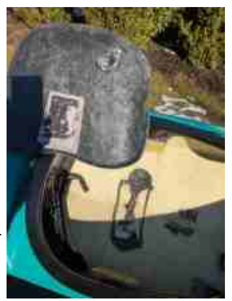
Removed bolted-in molded fiberglass seat showing support block and glue

By far the easier job is to remove a seat that is bolted unto seat hangers molded into the hull of the kayak. These should have used stainless steel bolts or screws with a nylon insert nut at the back and one or more stainless steel washers. If someone use regular old hardware store nuts and bolts (zinc, etc.) and they have corroded, it