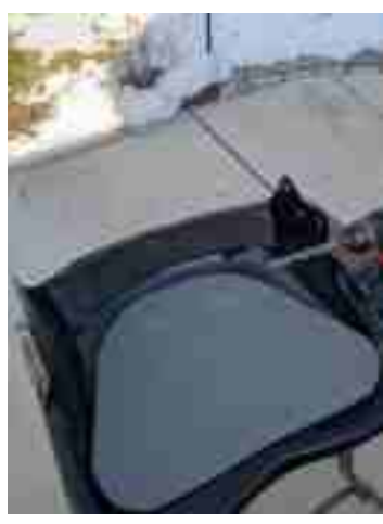
Removed seat with glued-in pads and drainage holes drilled.

Having attached the two straps to the seat hangers with the seat bolts and adjusted the straps to get a comfortable fit, I was ready to place the bungee support to keep the back band in position. I ran the length of bungee through the pad eye, making both ends even, then ran the ends through the lower webbing loops on the back band, back to the pad eye, then through the upper loops on the back band, pulling everything taut to properly support the back