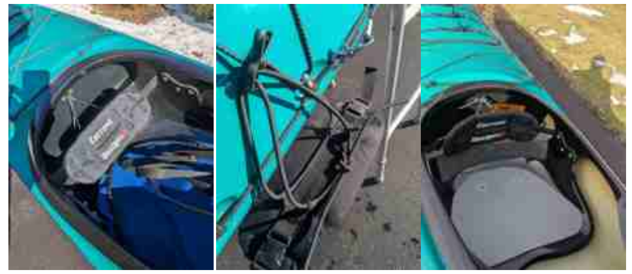
Loose bungee on back band; Detail of bungee support for back band; Installed seat with pads, properly supported back band and "If found..." sticker.

band in an upright position, and tied them off with a square knot. I left the excess bungee rather than cutting it off exactly since I might want to change the adjustment of the bungee support in the future.