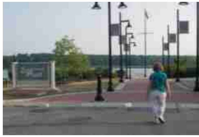
Approach to new Leonardtown Wharf

granted the colony, and more. We also peaked into the red one-room schoolhouse moved from elsewhere in the county, luxuriating in something the bygone school kids could only dream of: air conditioning.