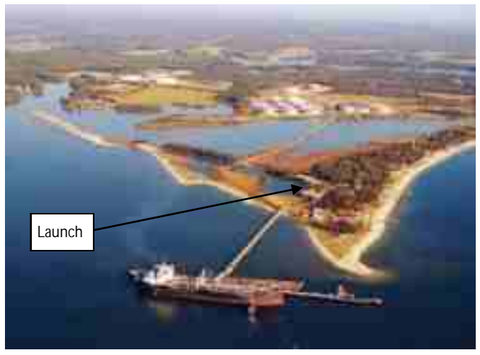
Overview of Piney Point Lighthouse launch area

Paddle Quest Maryland: <a href="http://paddlequestmaryland.com/">http://paddlequestmaryland.com/</a>