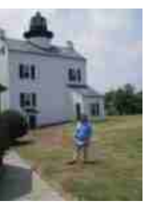
Replica Blackistone Lighthouse

granted the colony, and more. We also peaked into the red one-room schoolhouse moved from elsewhere in the county, luxuriating in something the bygone school kids could only dream of: air conditioning.