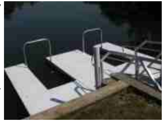
Kayak launch at Piney Point Lighthouse area

We ended our exploring weekend with Sunday dinner at Rips on Rt. 3 in Bowie. Not much paddling, but we