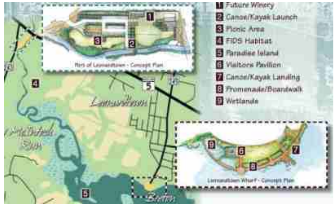
Site plans for Leonardtown Wharf (completed) and Port of Leonardtown (under way)

Driving back up Rt. 243 from Newtowne Neck, we stopped at another launch area, which shares a parking lot with Maryland's new est native winery. The McIntosh Run launch is currently a sandy area just downstream from the Rt. 5 bridge, a short hand carry down steps from the parking lot. I talked with Jim Beazley, who operated McIntosh Outfitters at this location and at the new Leonardtown Wharf. He informed me that Leonardtown plans to develop the winery site, including an upgraded kayak/canoe launch, a foot bridge over McIntosh Run, and a water trail between the two (see site plans). McIntosh Run looks like a nice, cool, shady paddle on these hot summer days, and leads down into the upper reaches of Breton Bay.