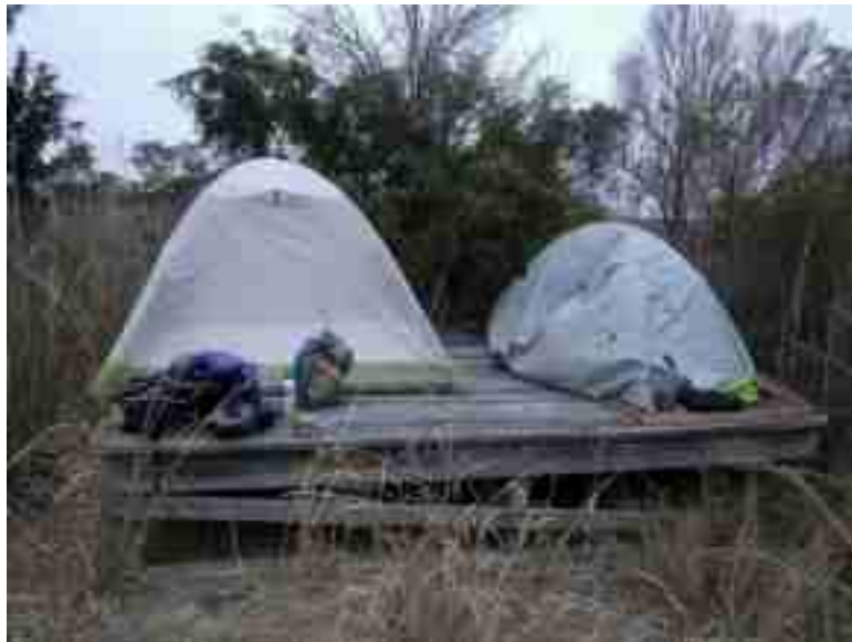
Backcountry campsites offer little beyond wooden tent platforms — and solitude. Pro tip: go early in the paddling season to avoid the bugs.

Joining me were Sue Sierke, Greg Welker and Dave Isbell. We were all paddling larger touring kayaks, were well equipped with dry suits and insulation to deal with 47-degree water temperatures, and were blessed with a benign weather forecast (partly sunny, air temps ranging from mid-40's to mid-60's, very little rain, and winds at 10-15 kts from the SW). We arrived at the Janes Island boat ramp about 10