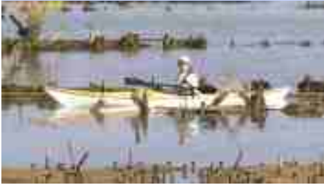
Saki's original photo of Mallows Bay, Yvonne Thayer center