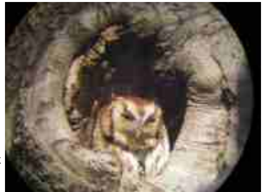
Eastern Screech-Owl ( Megascops asio)

We arrived back at Denton with an hour in hand before our demonstration time so we were able to wander the vendors and displays. I tried out a pit beef sandwich from a stand supporting the local hospice, and lemonade from a horse rescue support group. I dined while watching a Native American demonstration on the making of a stone knife, ax blade and arrow heads. There was an animal sanctuary display that had several owls present, including a pair of screech owls. I have heard the little critters for the past several weeks in the woods behind the house and now got to see what was making all that noise. There were two paddle sport vendors, in addition to several other vendors that I