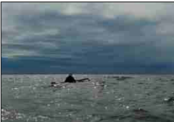
Distant landmarks can be hard to see when sitting down in a kayak – a view of the bay paddling south from Beverly Triton Beach