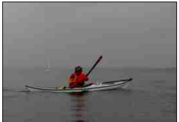
Rain can rapidly decrease visibility – paddling out of Kent Narrows toward Eastern Neck