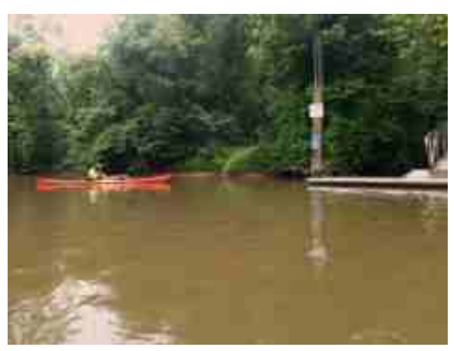
Figure I Gary Trotter after launching his loaded kayak

Launching kayaks loaded with a week's worth of gear off a floating dock is a bit trickier than a beach launch. We had to snake our empty long boats down a guard-railed ramp to the dock, get them in the water, load the gear, then scoot our butts off the dock into the cockpit without taking a swim. Everybody passed the first test with flying colors.