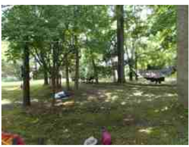
Figure 6 Our camp at Maxwell Hall; Gary Trotter and Sophie Troy

So, on the 4<sup>th</sup> day of our kayak camper, we were headed back UP the Patuxent to Spice Creek, the campsite we'd used the prior night. Thus our mileage was going to be about 58 miles, plus the 6 or so miles we did on Hall Creek (rm 52-rm23 = 29 miles x 2 + 6 = 64 miles in total) and we were