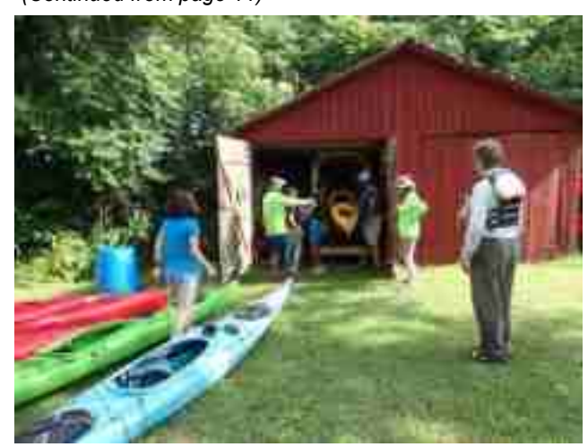
Figure 7 Preparing kayaks for campers