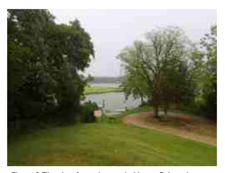
Figure 3 The view from the porch; Mount Calvert is now also an official launch

the expanse of Jug Bay. Our campsite for the night is nestled on the east shore of Jug Bay at Emory Landing (rm 41a), the second Anne Arundel County paddle-in campsite on the river. Part of the Jug Bay Farm Preserve, this entire area is now an Anne Arundel County park (see <a href="https://jugbay.org/jug-bay-wetlands-sanctuary-properties/">https://jugbay.org/jug-bay-wetlands-sanctuary-properties/</a>), but there is no kayak launch here at present.