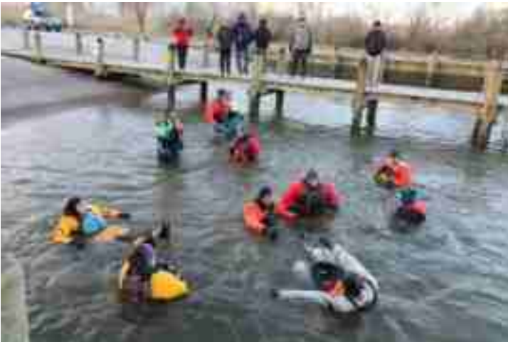
Swimming your gear at a CPA Cold Water Workshop

I spent a fair amount of time trying to research the origins of