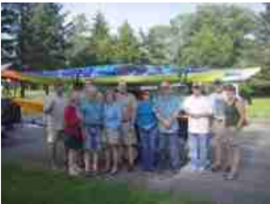
The Thousand Islands Trailer

With the summer months, the price of gas is on the rise again, making trips to favorite paddling destinations a greater cost burden. Paddling Magazine just featured a few tips to reduce the cost of your paddling trips. The shape and size of your boat, tie-down method, road conditions and terrain, as well as wind direction and speed are all variables that will also affect your mileage. They also suggest reducing the windage of your boat by using cockpit covers, inflating air bags for canoes, and using fairings.