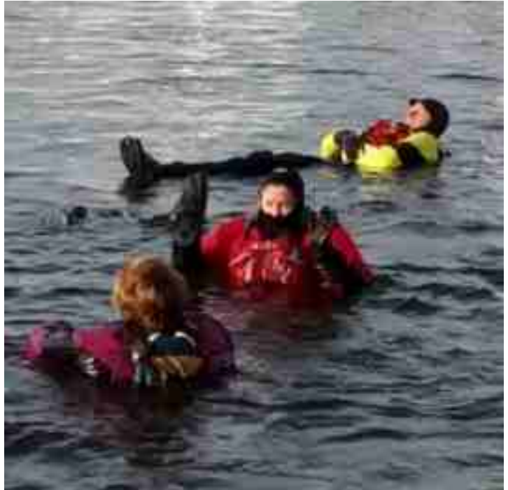
CPA Cold Water Workshop 2015

recommended that you swim test your gear before setting out to determine if what you are wearing is suitable for the conditions. Just wading out into the water can tell you if you will be warm enough and that there are no problems with your gear. Think about how long you might be in the water if things go wrong. Rescue can take a lot longer than you might think unless you get lucky.