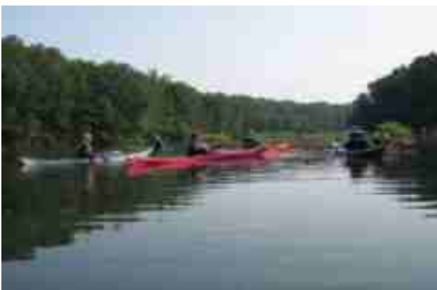
Pirates of Sugarloaf on Tridelphia Reservoir

These times do change as the group avoids bad weath-