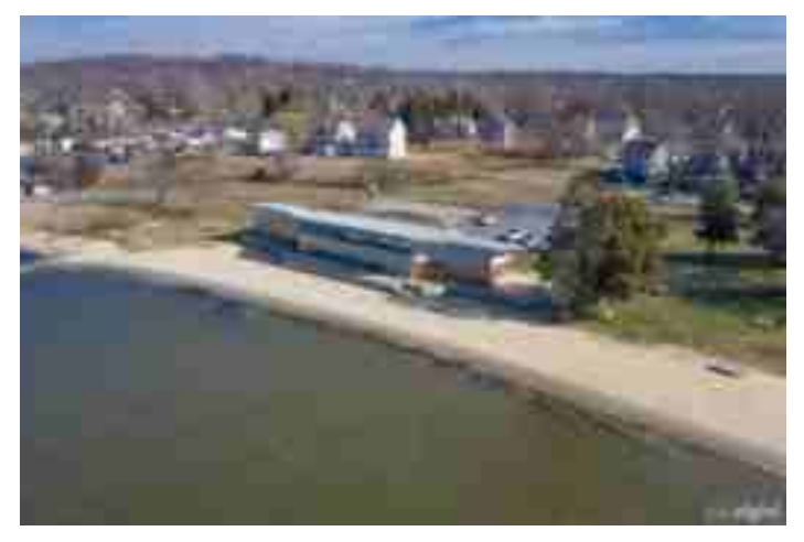
Selby Bay Community Beach Club House

We are all looking forward to having a bunch of new faces turn out for the CPA Fall-out-of-your-Boat/ Skills Day, Gear Swap and picnic on August 20. We will be at a brand-new location on the South River. Long-time CPA members, Jess and Lise Parker are graciously hosting us at the private Selby Bay Com munity Beach club house (3715 1<sup>st</sup> Avenue in Edgewater, Maryland), which boasts an inside space with restrooms and a beach front view. There is space for skills and practice inside its jellyfish-netted protected swim area. For details, see <u>https://</u> <u>www.meetup.com/the-chesapeake-paddlers-association/</u> <u>events/287271338/</u>