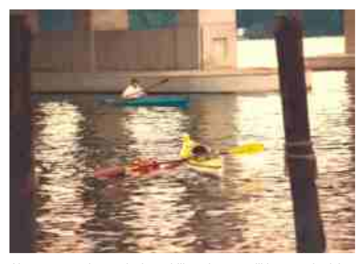
Always remember, today's paddling pictures will be somebody's "Good Old Days" eventually.