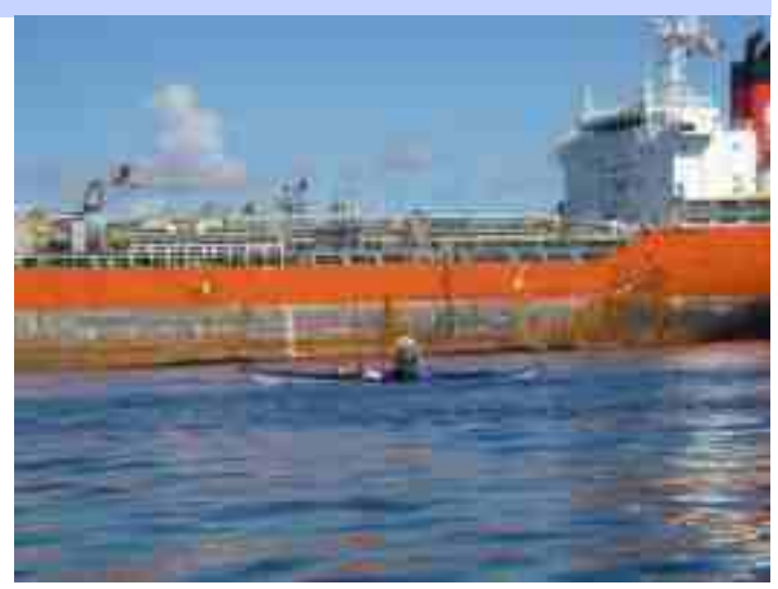
Kayaking with big ships in the American Channel, Thousand Islands, US/Canada

We all know there are many situations where kayaks do have the right of way. Those of you who wish to defend that right of way need read no further. There are also situations where we have neither the legal nor the moral right of way. Examples: