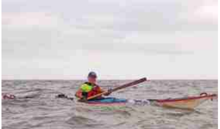
Lives in: Cockeysville, MD

Real job : Occupational Therapist. Mostly retired now but I still work a couple of days a month.