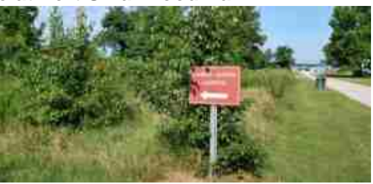
Sign for the new "pocket-change" launch at Fort Smallwood Park

What's a "pocket-change" launch? A pocket change launch is a put-in created at minimum expense – pocket change – in an existing county park or publicly owned land. The new Fort Smallwood put-in was created by mowing a short path to the water and putting up a sign.