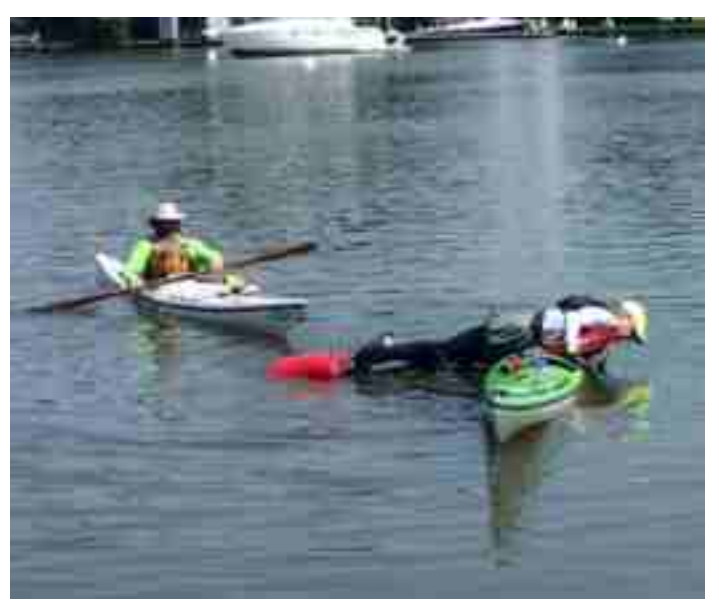
Self-rescue instruction at Fall-Out-of-Your-Boat Day, 2019