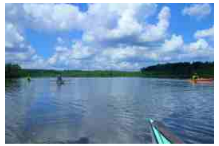
Paddling on Menokin Bay at Cat Point Creek

If you have non-kayaking friends that you would like to introduce to the sport, this is an attractive launch. Rappahannock Outdoor Adventures, in partnership with the Menokin Foundation, have rentals and guided tours leaving from the launch in season. See <a href="https://www.menokin.org/kayak">https://www.menokin.org/kayak</a>