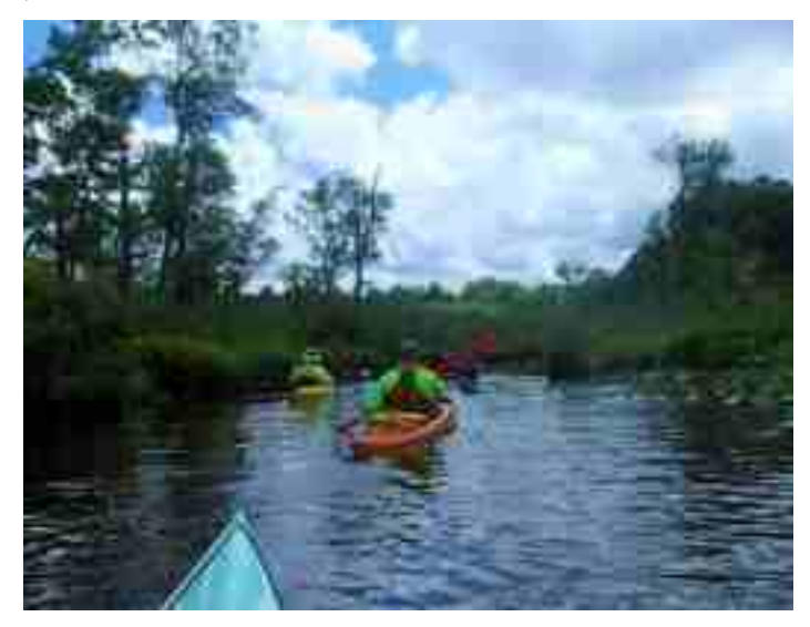
Paddling Cat Point Creek above Menokin to Woodville Creek

Find more launch sites and paddle-in camping sites at the CPA webpage under "Resources" at the <u>Chesapeake Bay Access and Paddle-in Campsite</u> <u>Interactive map</u>.