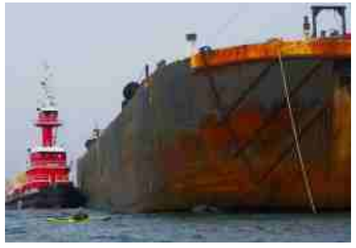
Close encounter of the wrong kind

degree course change would be enough to safely avoid a collision, the other skipper can't detect that small a change in course. It's best to make a big change, like 45 degrees (or even stopping), and then hold the new course for a few minutes