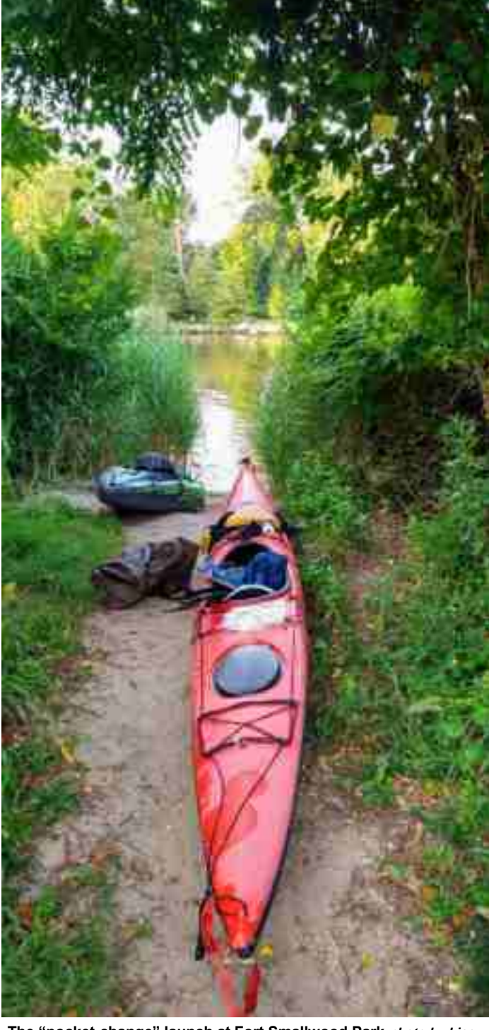
The "pocket-change" launch at Fort Smallwood Park

Weinberg Park is an Anne Arundel County park located in Pasadena, MD. Weinberg Park has no admission fee. Weinberg Park website: <u>https://www.aacounty.org/locations-and-</u> <u>directions/harry-and-jeanette-weinberg-park</u>