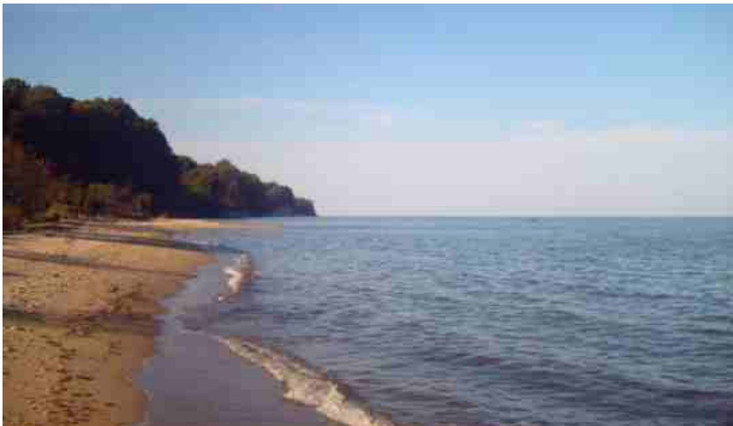
Looking north towards Dares Beach from the beach at the mouth of Parkers Creek. The beach is popular with local boaters, hikers and paddlers.