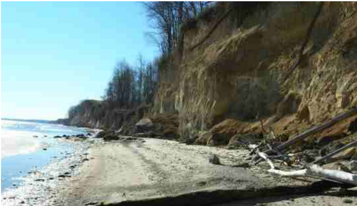
Large cliffs are common between Breezy Point and Dares Beach. Be careful if you make a stop, those big rocks are from slides.

If you are interested in paddling Parkers Creek, there's public access at Breezy Point Marina ( http://www.breezypointmarina.com ). They have a large boat ramp and the launch fee is $15.