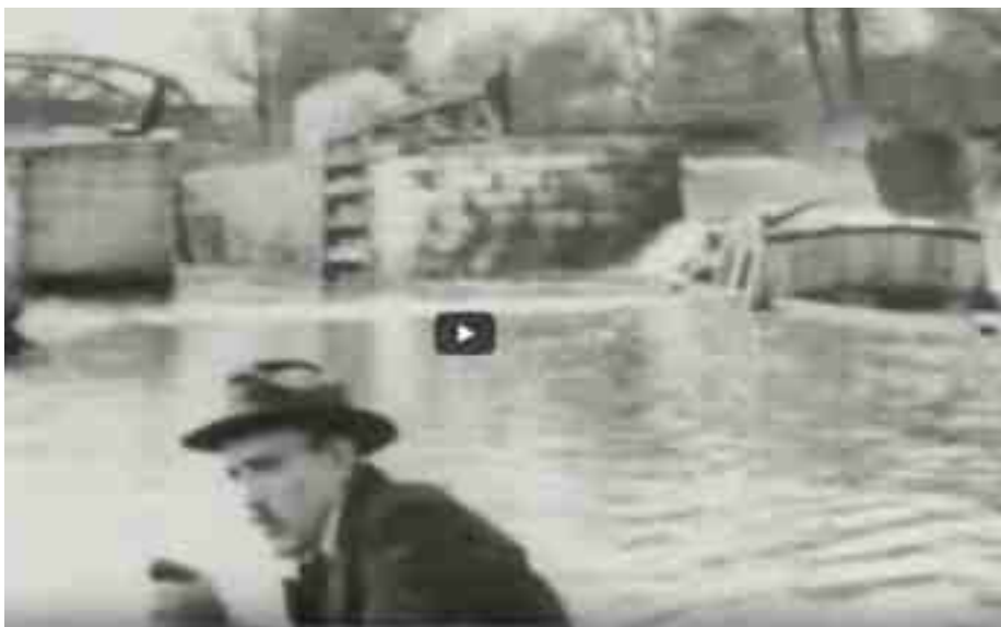
A Thomas Edison film from 1917 shows what a trip from Cumberland, MD to Washington, DC on the C&O Canal was like.

The video is courtesy of the Lovettsville Historical Society and Museum .