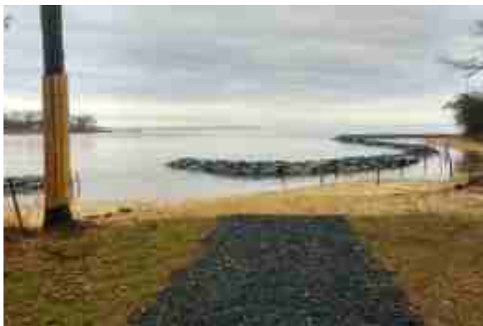
Park improvements included repairs to the access trail, beach protection and a new kayak launch.

By 2018, the island had split in half, and on at least one stormy day in 2019, and again in April 2020, it was underwater. Meanwhile, waves had chewed at the park's shore and the forest.