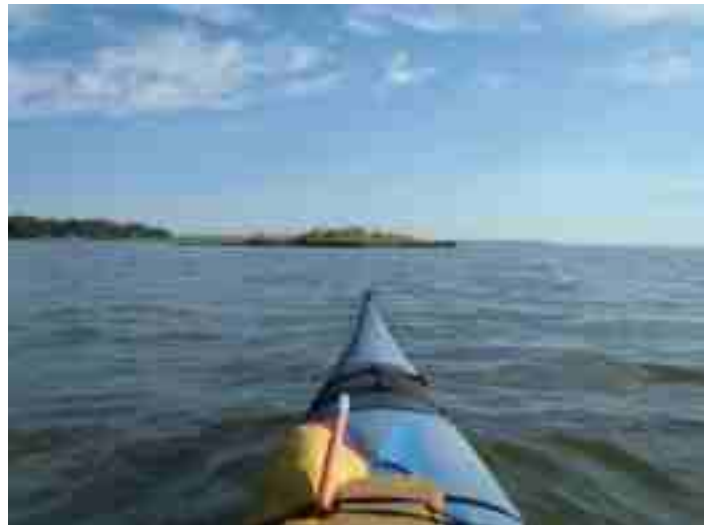
In the early 2000's, the original shoreline was severed to form a small island.

In 2003, on my first paddle to work, the park had a peninsula sticking out into the Bay. After a while it got severed by a channel. At first it was a tight and shallow squeeze for my kayak, but soon it got wide and several