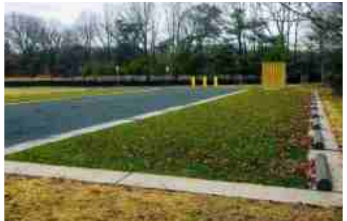
A new parking lot expands public access, but be sure to get the gate access code before you visit.

Boat access was difficult for those who don't live in a waterfront neighborhood. Paddling here is very weather-dependent since the shore is exposed. Overall, Jack Creek Park is a great natural asset for the residents of Anne Arundel County.