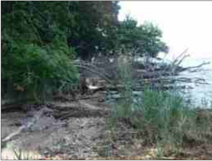
In 2018, Anne Arundel County embarked on a restoration effort to repair the damaged beach and access trail.

feet deep. For several years, I enjoyed swimming out to the island from the beach.