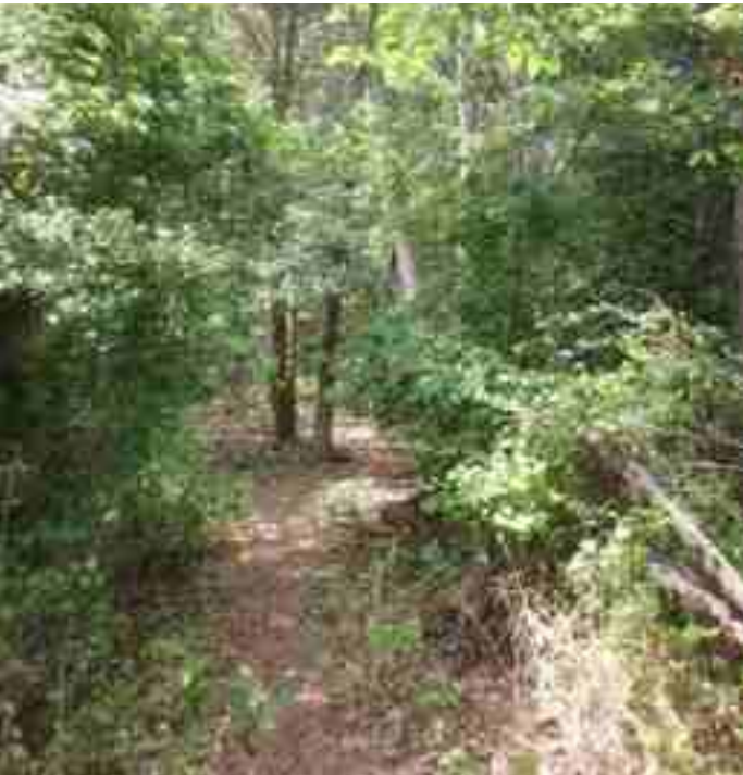
Prior beach access was via a rough half-mile trail.

For many years, access to the park was difficult. It was