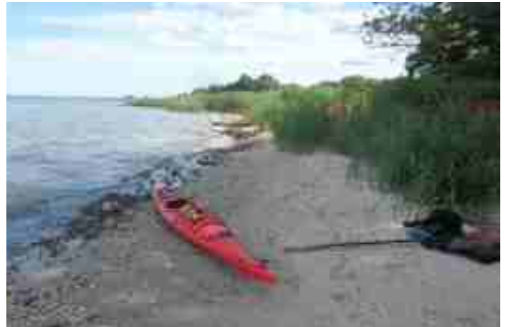
Jack Creek Park shoreline in days past before the effects of wind and waves.

either by boat or a half-mile walk to the water. The park has gone through many changes, from the erosive effects of rising sea levels to new construction to mitigate those effects and allow easier access to a new a canoe/kayak launch.