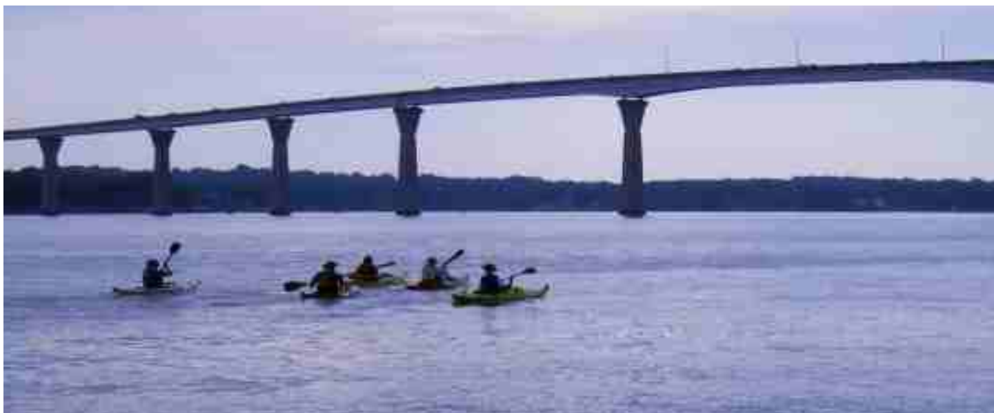
Enjoying evenings of paddling is the core of CPA piracies. The Patuxent Pirates heading out toward the Route 4 bridge at Solomons Island in 2009.