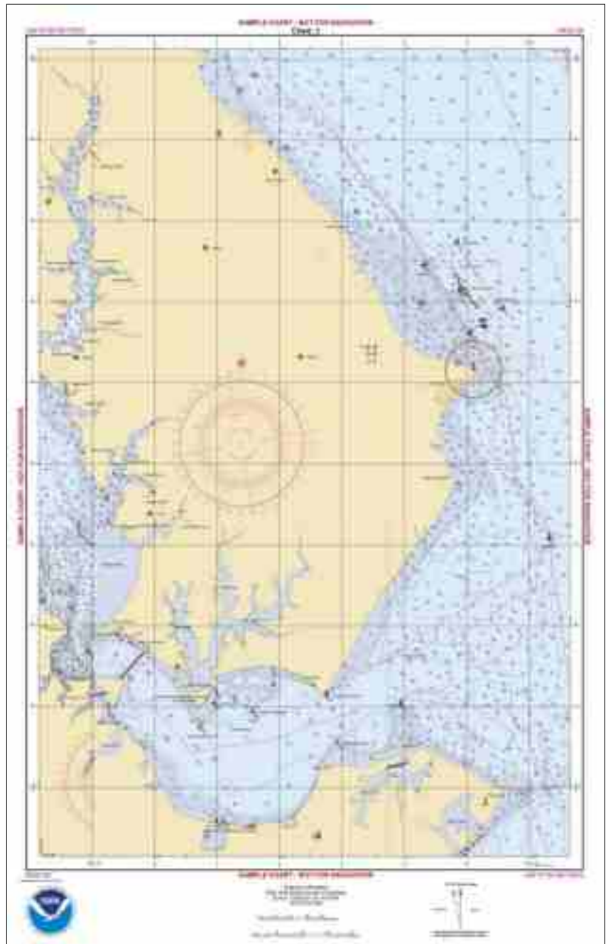
Figure 1: A 1:25,000 scale chart of the area from Solomons Island to the Cove Point lighthouse.

Print-on-demand means that the output of a digital