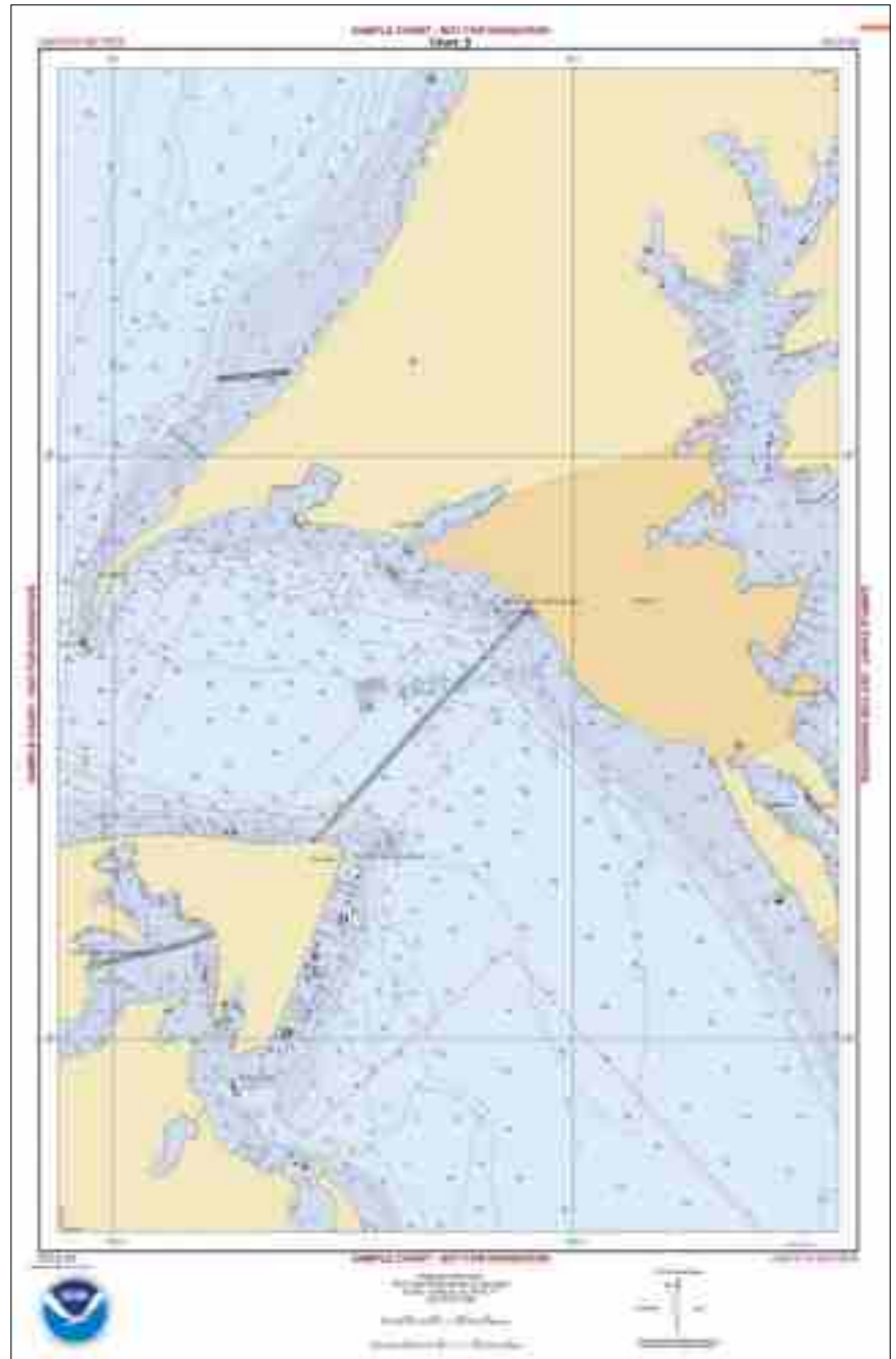
Figure 2: Digital charts can be scaled to show more detail for a planned trip such as this 1:5000 scale enlargement of an area from the chart in Figure 1.

Note: This article was based on information published in https://www.esri.com/about/newsroom/arcnews/nautical-charts-go-digital-with-help-from-gis/ .