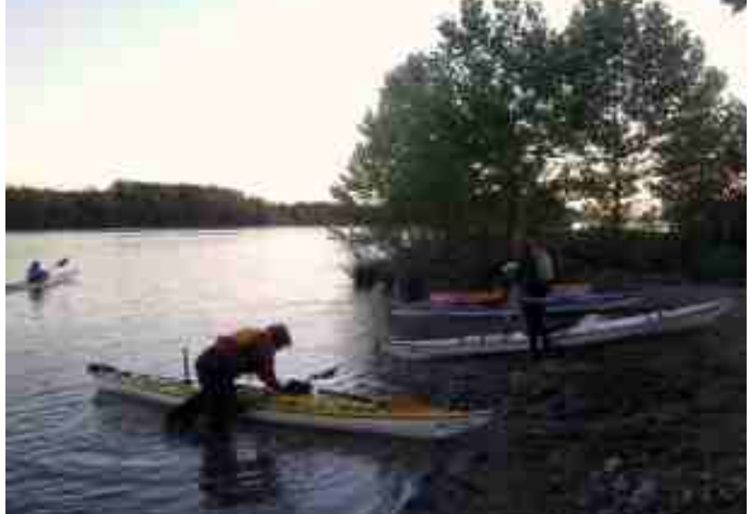
After work piracy paddles often race sunset. Pictured above, the Pirates of Sugarloaf landing for a snack on an island upstream of Riley’s Lock in 2017.