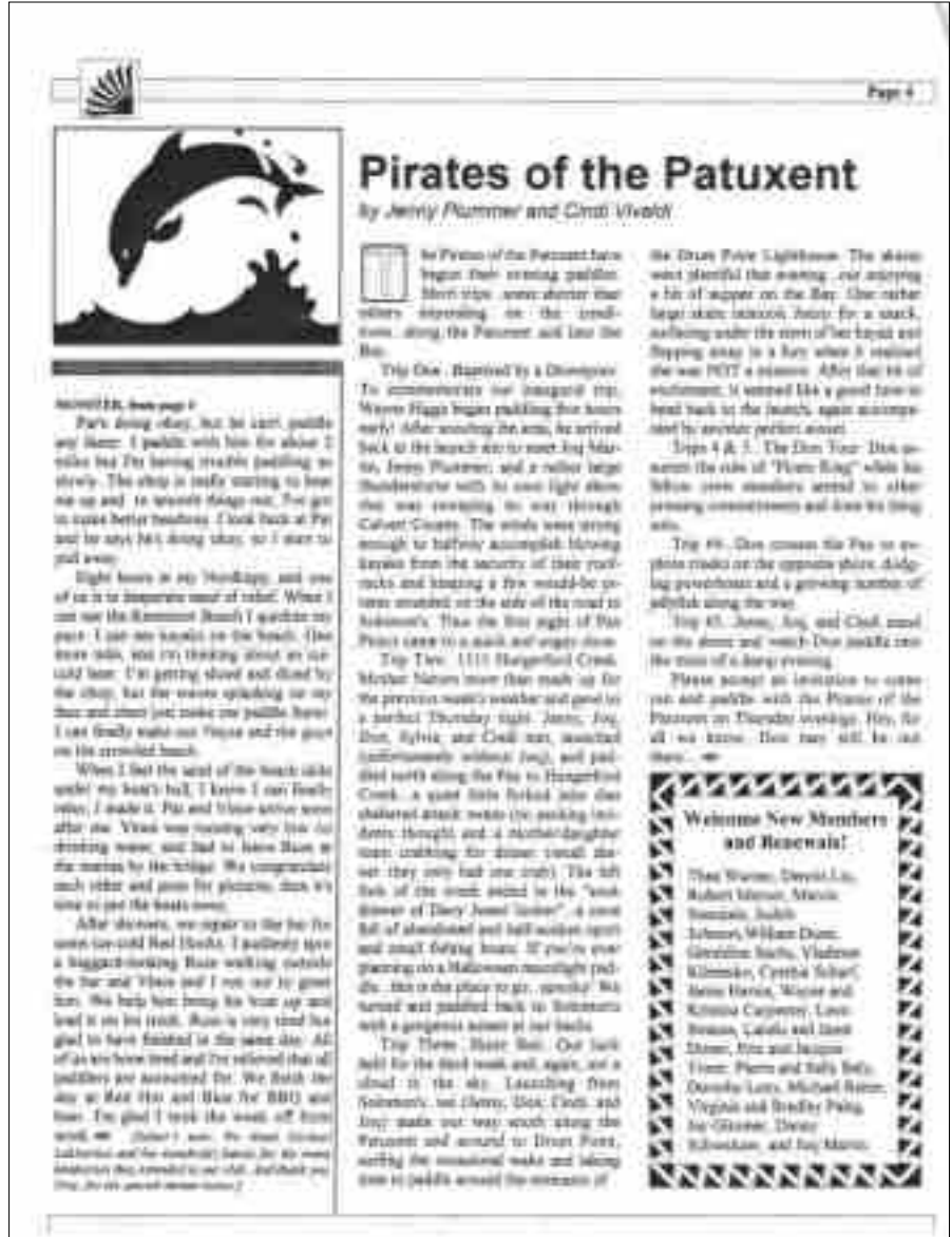
An article from the CPA newsletter about the first trips in 1995 by the Pirates of the Patuxent.