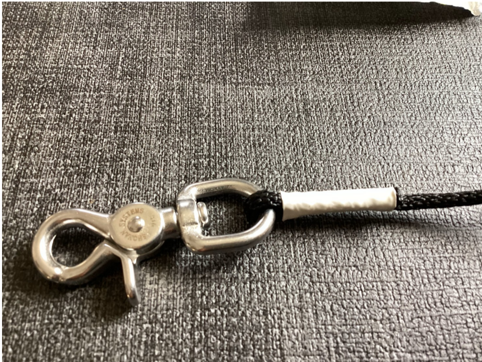
Figure 7 Snap hook attached with sewn eye covered by heat shrink tubing gloves.

A related project is a “pig tail” with two snap hooks on either end. This is a very useful piece of rigging whose main function is to attach you to your kayak when you capsize to keep the boat from drifting away as you arrange the self-rescue. It can also be used for a hull-to-hull contact tow or just to keep two boats together when rafting. It is constructed in exactly the same way as the painter above but the length is only 2-3 feet. Many old-timers actually wear the pig tail on their PFD, but I store mine on the deck immediately in front of the cockpit doubled over once or twice.