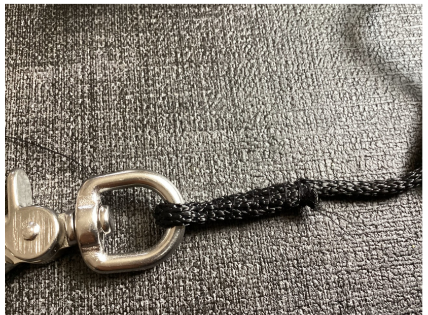
Figure 5 Snap hook attached with sewn eye

Once you have the painter constructed with a snap hook on both ends, you can attach it one snap hook to the metal loop on the bow (if you don't have a metal loop or a security bar, you can loop it through the front of the perimeter lines and attach the snap hook to the painter itself). Now daisy chain the excess length of the line to reduce its length on deck. To daisy chain a line, start at the end attached to the kayak, form a loop, draw the standing part of the line through the loop an inch or two, then draw the standing part through this bight, and so on until you reach the end of the line where the other snap hook is attached. To secure the daisy chain, pass the end with the second snap hook through the last bight. You can now attach the second snap hook to the bungee or perimeter line nearest the cockpit. To release the full length of the line, simply pass the end of the line with the second snap hook through the last bight in the opposite direction and pull...All the previous daisy chain loops will release giving you the full length of the line (see video).