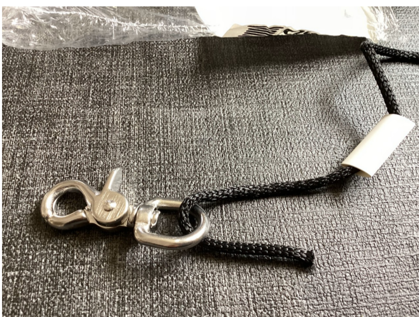
Figure 4 Snap hook, line and heat shrink tubing

Once you have the painter constructed with a snap hook on both ends, you can attach it one snap hook to the metal loop on the bow (if you don't have a metal loop or a security bar, you can loop it through the front of the perimeter lines and attach the snap hook to the painter itself). Now daisy chain the excess length of the line to reduce its length on deck. To daisy chain a line, start at the end attached to the kayak, form a loop, draw the standing part of the line through the loop an inch or two, then draw the standing part through this bight, and so on until you reach the end of the line where the other snap hook is attached. To secure the daisy chain, pass the end with the second snap hook through the last bight. You can now attach the second snap hook to the bungee or perimeter line nearest the cockpit. To release the full length of the line, simply pass the end of the line with the second snap hook through the last bight in the opposite direction and pull...All the previous daisy chain loops will release giving you the full length of the line (see video).