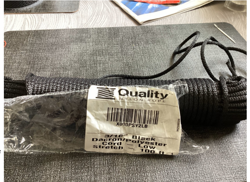
Figure 1 3/16" braided Dacron polyester line

An easy way to attach your painter to the kayak is with a knot, but knots suffer from several drawbacks: They untie; unless you want them to in which case with wet or gloved hands, they don't; and they create big glumps at the attachment points that may catch on things or otherwise impede handling the line. I use stainless steel or brass (impervious to saltwater) swivel snap rings at both ends of my painter to attach it to the boat, and to attach it to itself around bollards, cleats or trees. Plastic S-hooks or other gated hooks are alternative, but are usually not as strong as metal ones. Be sure the metal springs or gates are corrosion resistant, not always the case on cheaper plastic or aluminum carabiners or S-hooks.