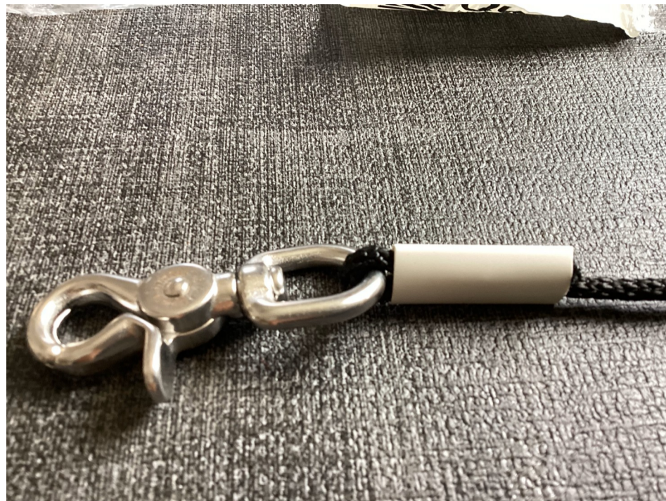
Figure 6 Heat Shrink slipped over sew eye shank

To use the painter as an emergency tow line, detach the second snap hook nearest you, release the daisy chain, run the line around your waist or the cockpit rim and attach the snap hook to the painter. Have the towee or someone else detach the snap hook from the bow and attach it to the towee’s bow perimeter lines, snapping the hook to the painter itself (I would NOT attach to the bow loop on the towee’s kayak as it could pull out). This rig is not as comfortable, easy to release or as safe as a real tow line, but it will serve in a pinch to get someone off of rocks or out of the surf. The value of the snap hooks should be obvious in this situation, vs. struggling with wet, jammed knots, particularly if you are wearing