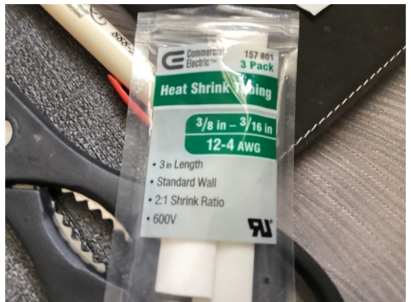
Figure 3 3/8" to 3/16" Heat Shrink Tubing

Again, you could just tie a knot to secure the snap hook to the painter, but that kinda defeats the purpose of avoiding knots in the first place. I use a method of sewing the ends of the bight of line, referred to nautically as sewn eye (vs. a spliced eye in laid rope). I use regular polyester sewing thread and a medium needle to sew the end of the line passed through the loop on the snap hook to itself using a dozen or so stitches back and forth. BEFORE you start sewing, slip a 3/8" or 1/2" length of electrician's shrink tubing (see below for sources) onto the line. Once finished with the stitching, you slip the shrink tubing over the sewn eye shaft and apply heat from a heat gun or hair dryer to shrink it over the stitching. This is cosmetic and doesn't add much to the strength of the join, but makes it look neat. If you use a contrasting color shrink tubing (I used white on my black line), it helps mark the end of the line where the snap hook is located.