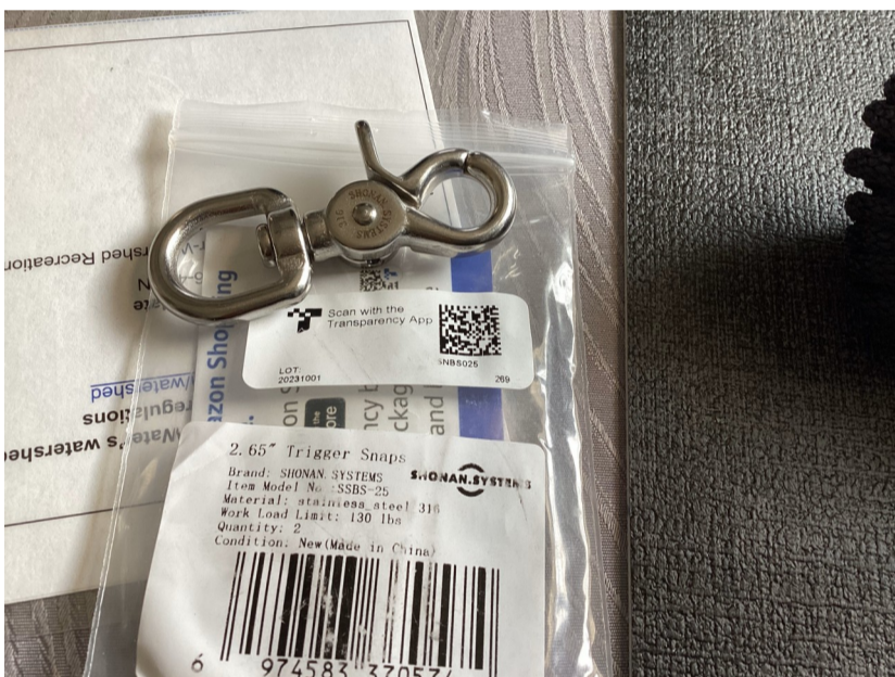
Figure 2 Stainless steel swivel snap hook

Again, you could just tie a knot to secure the snap hook to the painter, but that kinda defeats the purpose of avoiding knots in the first place. I use a method of sewing the ends of the bight of line, referred to nautically as sewn eye (vs. a spliced eye in laid rope). I use regular polyester sewing thread and a medium needle to sew the end of the line passed through the loop on the snap hook to itself using a dozen or so stitches back and forth. BEFORE you start sewing, slip a 3/8" or 1/2" length of electrician's shrink tubing (see below for sources) onto the line. Once finished with the stitching, you slip the shrink tubing over the sewn eye shaft and apply heat from a heat gun or hair dryer to shrink it over the stitching. This is cosmetic and doesn't add much to the strength of the join, but makes it look neat. If you use a contrasting color shrink tubing (I used white on my black line), it helps mark the end of the line where the snap hook is located.