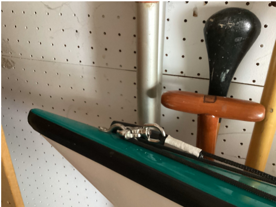
Figure 8 Snap hook attached to fixed metal loop on bow

3/8 in. Heat Shrink Tubing, White (3-Pack) $2.40/bag https://www.homedepot.com/p/Commercial-Electric-3-8-in-Heat-Shrink-Tubing-White-3-Pack-HS-375W/311129135