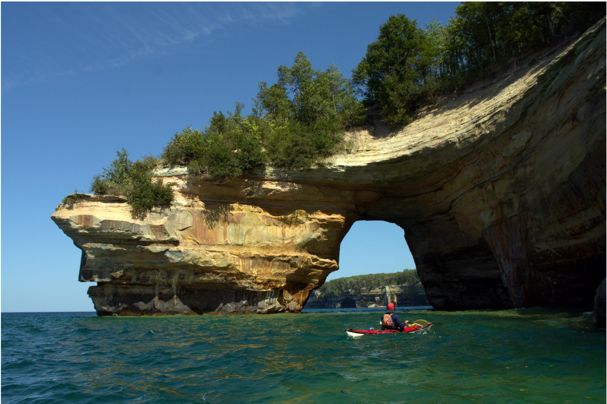
Pictured Rocks National Lakeshore, Lake Superior, Michigan