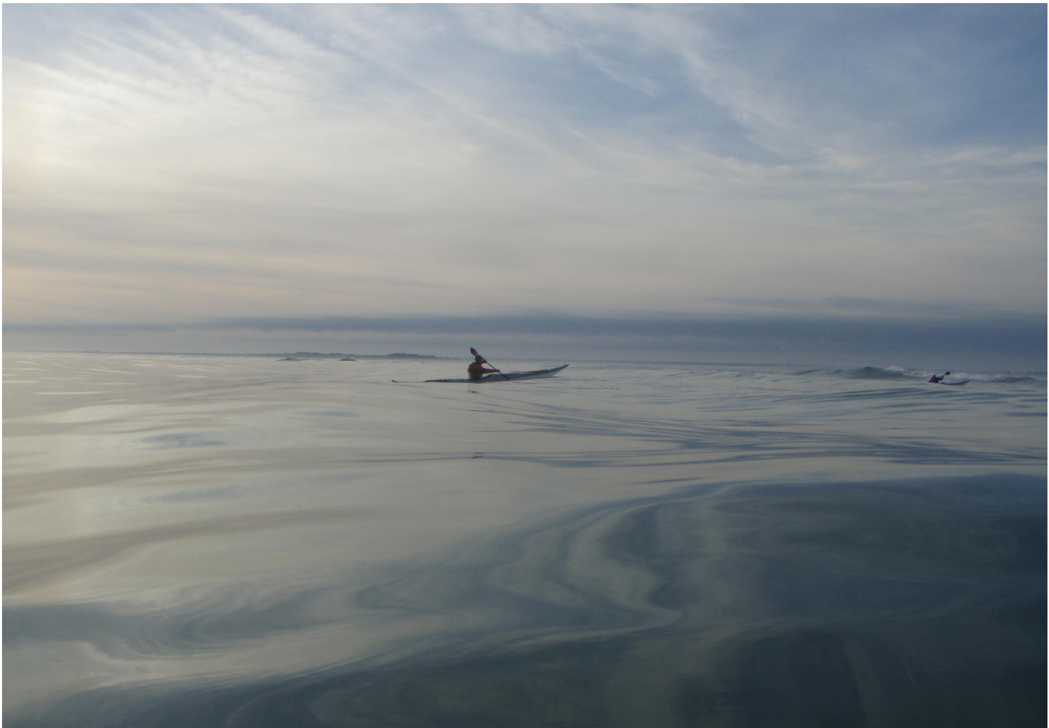
Outer Banks. Swansboro, NC