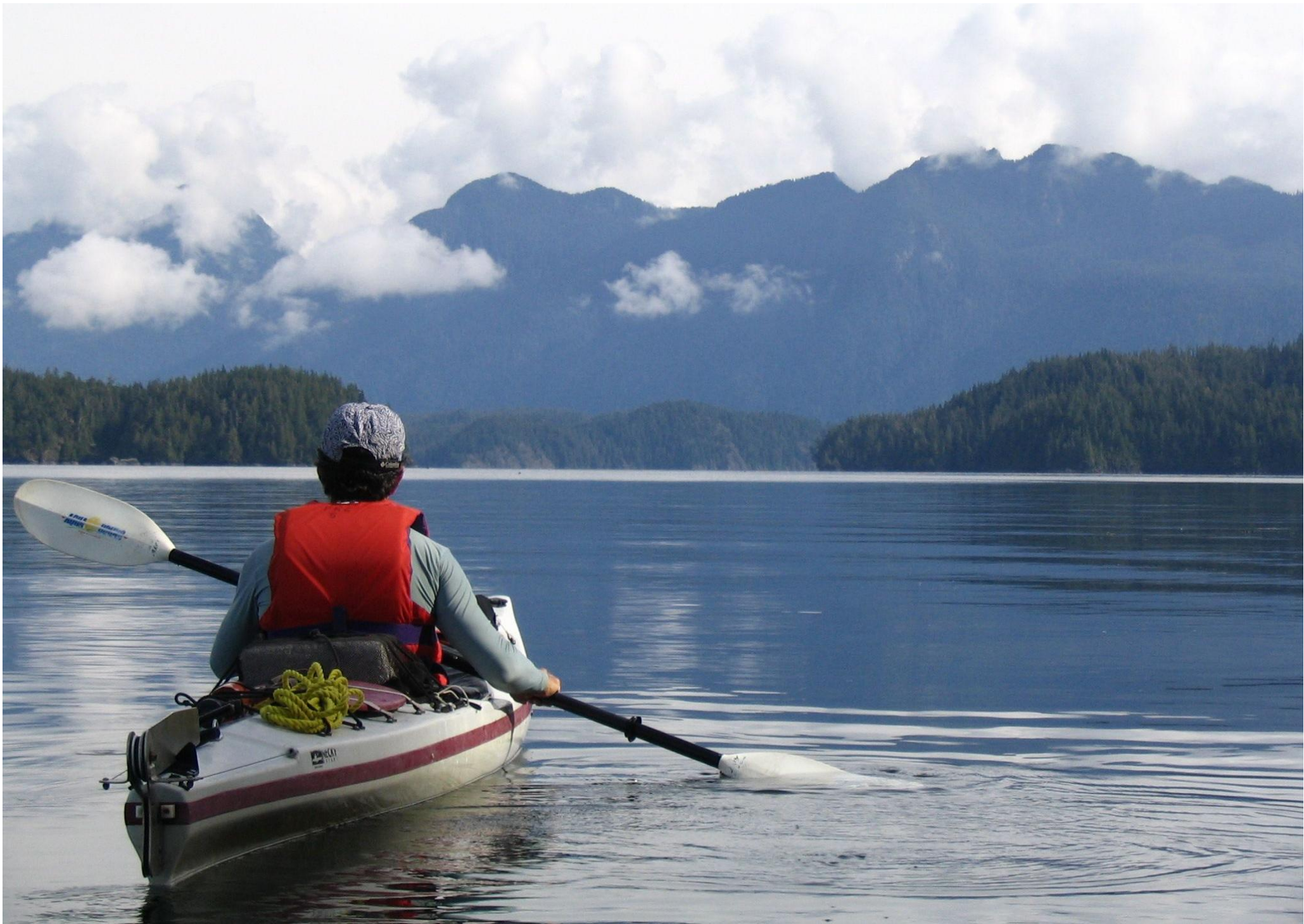
Catface Mountain, Vancouver Island, BC, Canada by Hank McComas