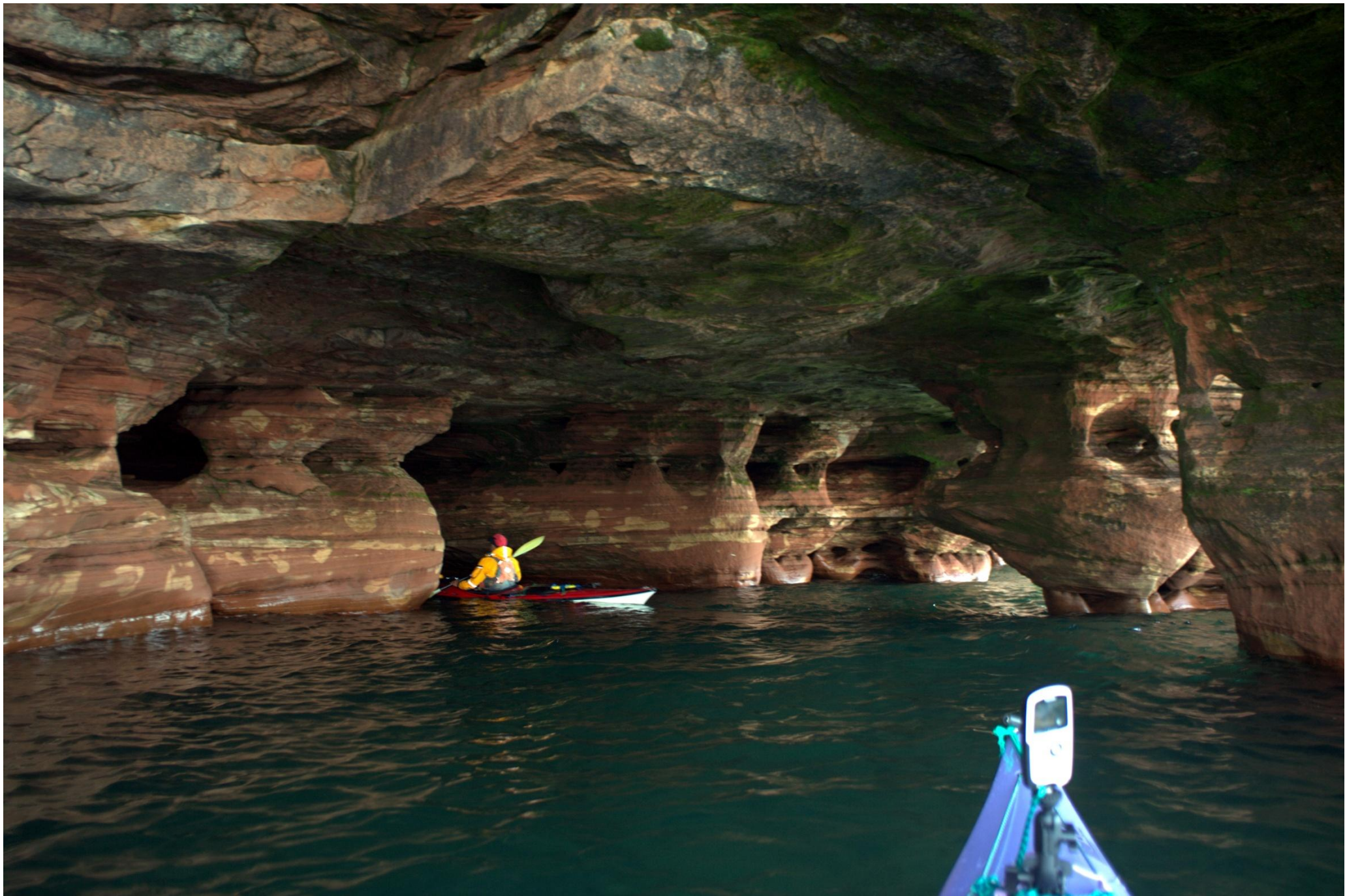
Devil's Island Sea Caves, Apostle Islands, Lake Superior by Catriona Miller