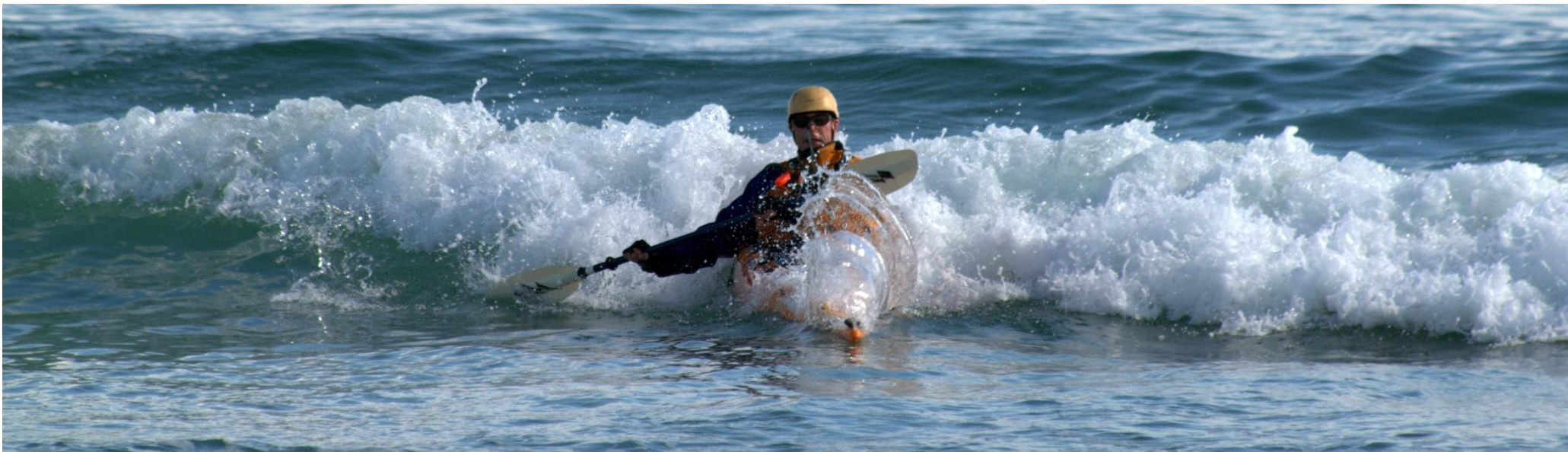
Cape Lookout National Seashore, North Carolina