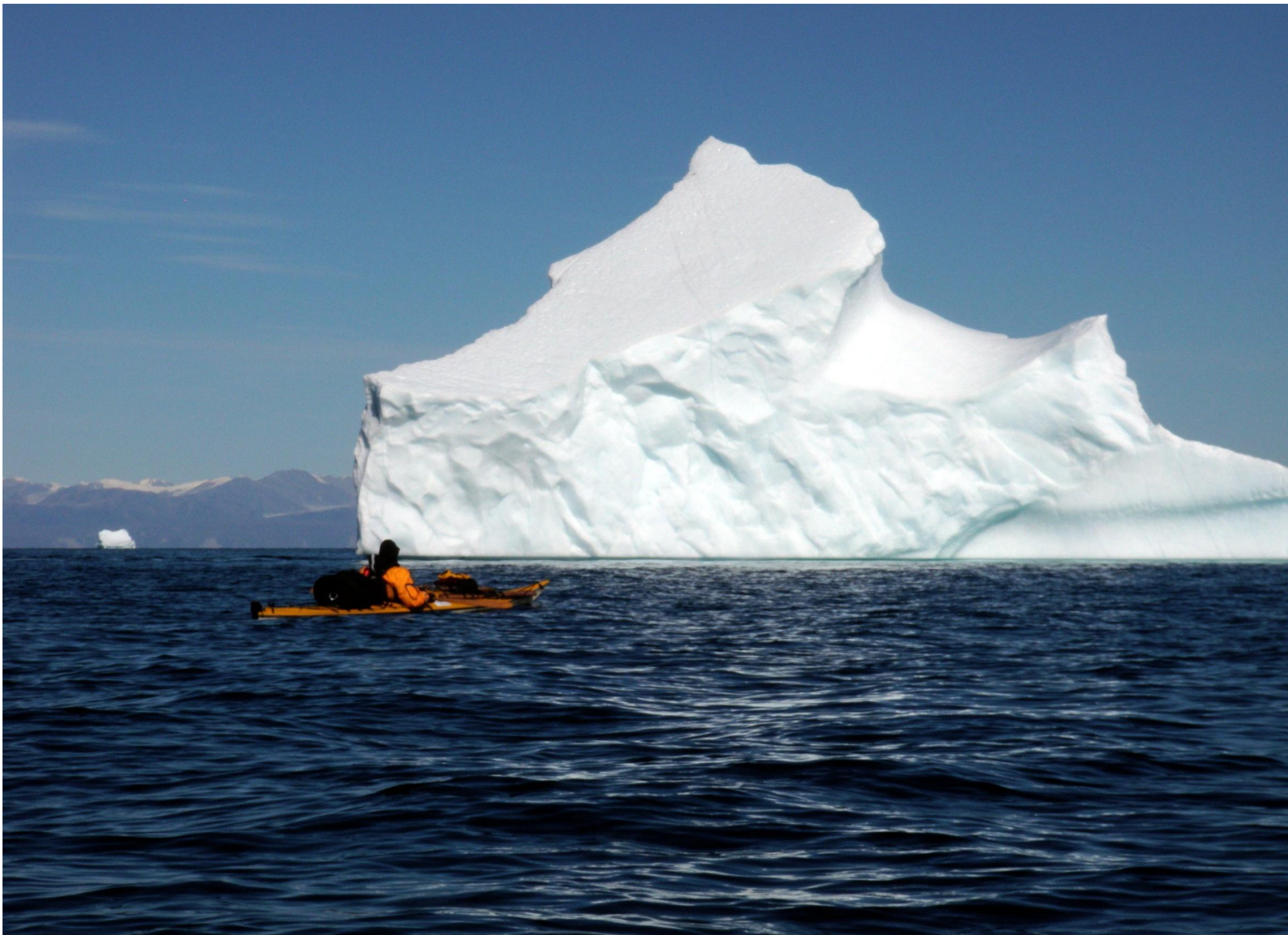
Eclipse Sound on N. Baffin Island, 72.5N latitude by Dave Isbell