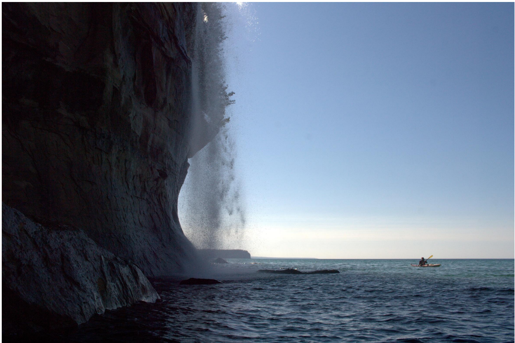
Spray Falls at Pictured Rocks National Lakeshore, Lake Superior, Michigan