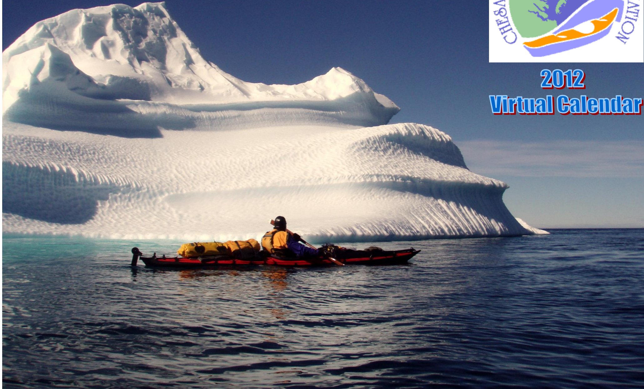
Eclipse Sound on N Baffin Island 72.5N latitude, by Marshall Woodruff