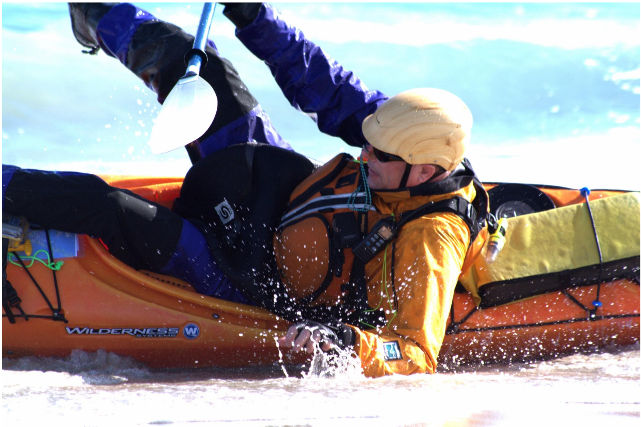
Cape Lookout National Seashore, North Carolina