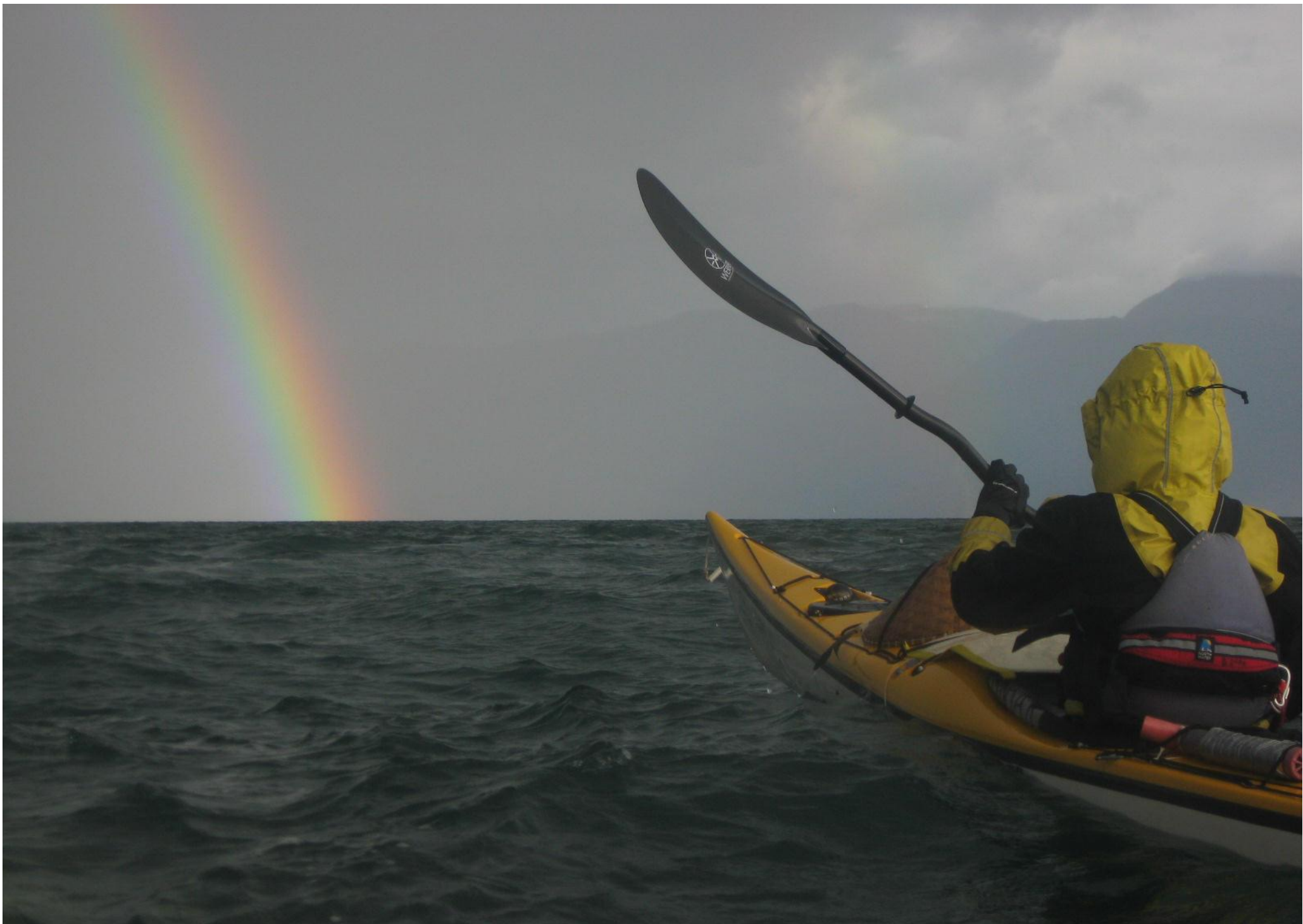
Jorge Montt Glacier, Patagonia, Chile