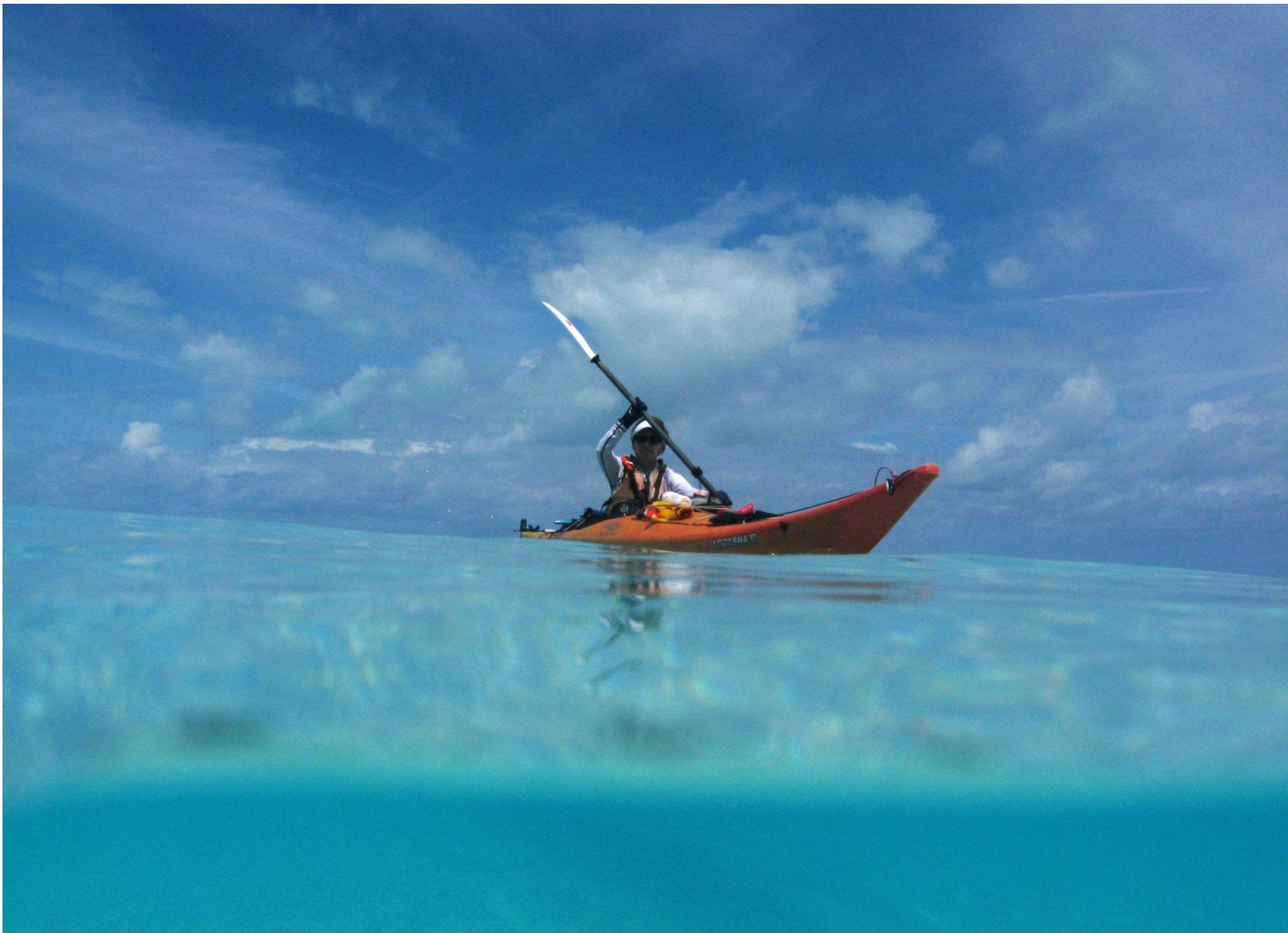
Barre Terre, Great Exuma Island, Bahamas