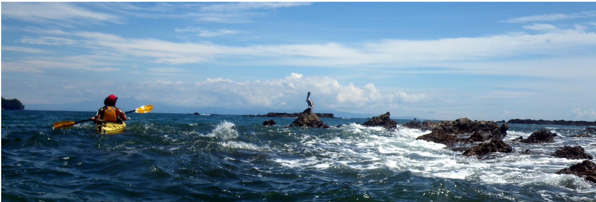
Playa Tambor, Costa Rica